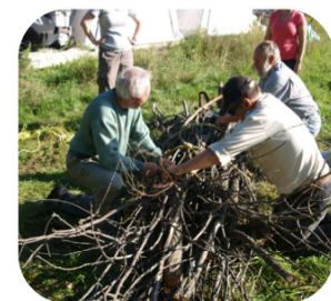
Figure 4: Tying together a brush pile.

Make the brush piles small enough that they can be lifted by two or three people. Try lifting one of your first brush pile before constructing more.