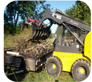
Figure 5: Using a skid steer to load a brush pile onto a trailer.

Step 2: ➤ Unload brush piles from the trailer and load them onto the barge or pontoon. If you are moving the brush piles manually, rather than with a loader, station 2-3 volunteers at the trailer and 2-3 volunteers in the boat. You will be able to load 3-4 brush piles into the boat, depending on its size.