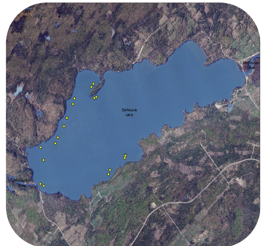
Figure 2: Map indicating location of brush piles.