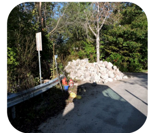
Figure 3: Clean, washed rock is stockpiled before being loaded onto a crane bucket to lower into the spawning bed.