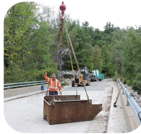
Figure 6: Loader is bringing rock from a pile to place into crane bucket.

If you're using a high-hoe: Pile the washed rock near the edge of the water. Use the high-hoe to move the rock into the water. The high-hoe can create a rock road to enable it to reach all areas of the spawning bed and then remove the road as it finishes the project. This ensures that the high-hoe is not travelling along the existing substrate.