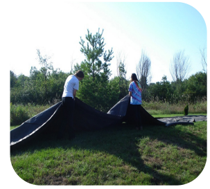
Figure 4: Adding the floats and chains to a new silt curtain.

If the water is too deep to walk through: tie or stake the silt curtain to shore, then back a boat around the spawning bed, releasing the curtain out of the boat's bow. You may need to weigh the curtain down with rocks to keep it in place.