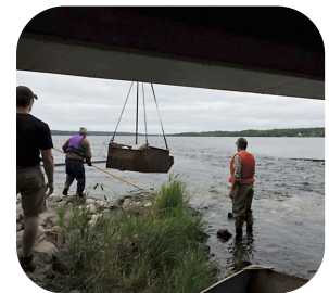
Figure 7: Crane lowers rock from a bridge and volunteers spread rock on the spawning bed.

Step 4: Using a high-hoe or crane, scatter the boulders throughout the spawning bed to provide resting areas for the spawning walleye.