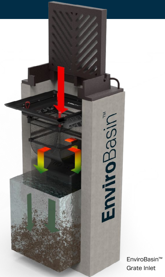
EnviroBasin™ Grate Inlet