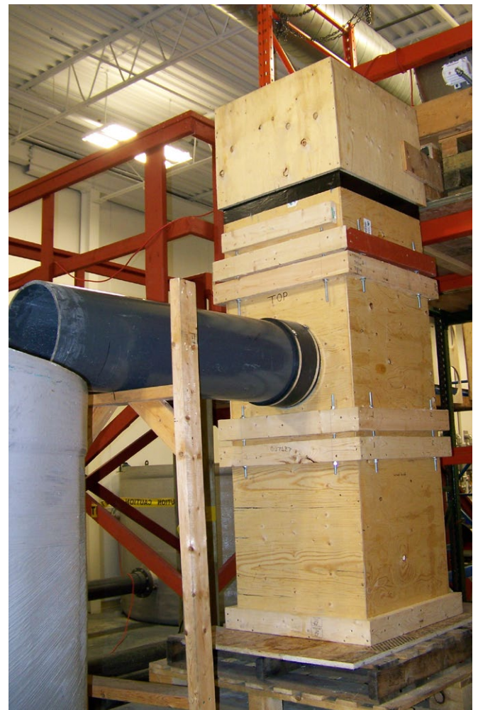
EnviroBasin™ Lab Testing