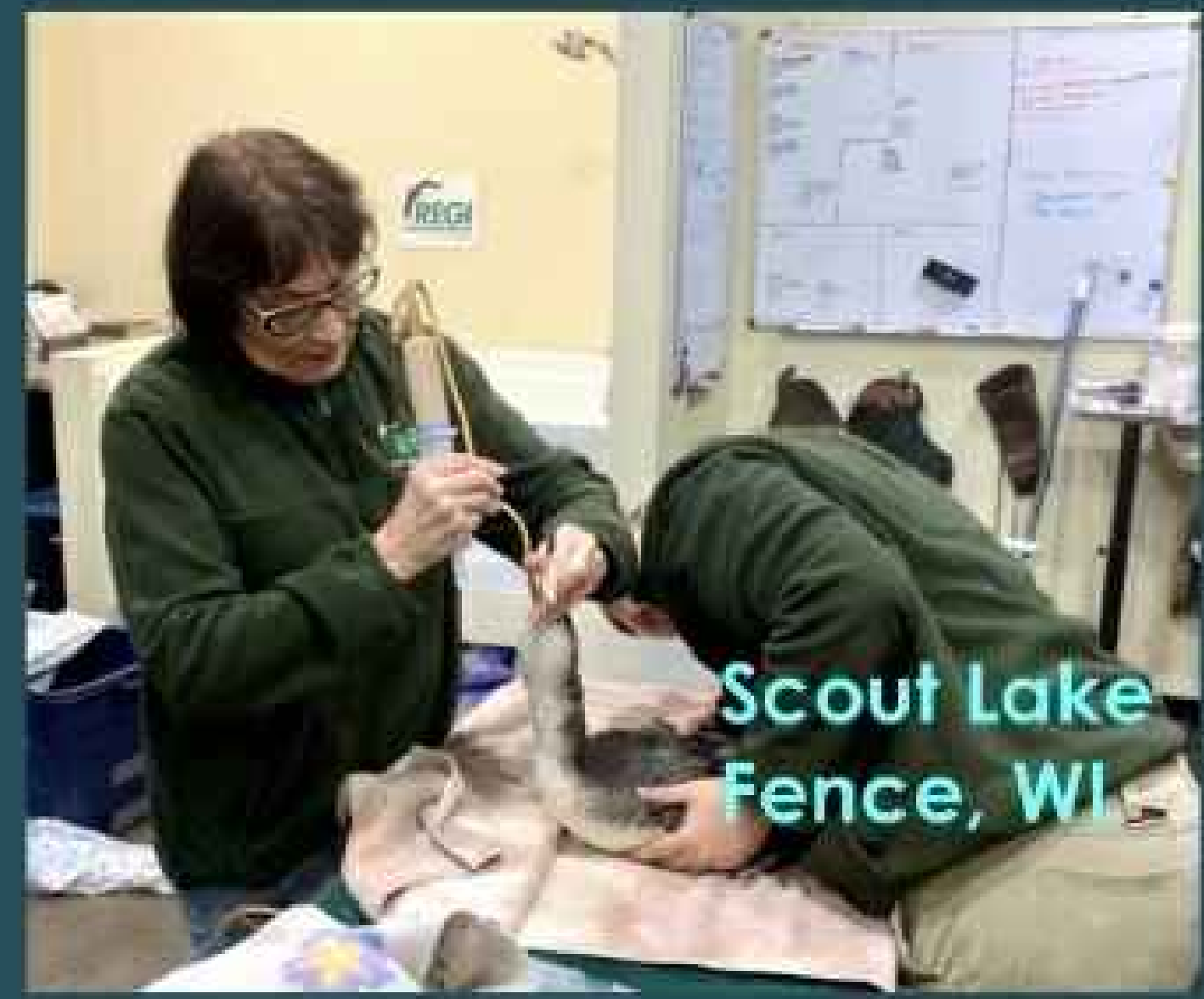
Scout Lake Fence, WI