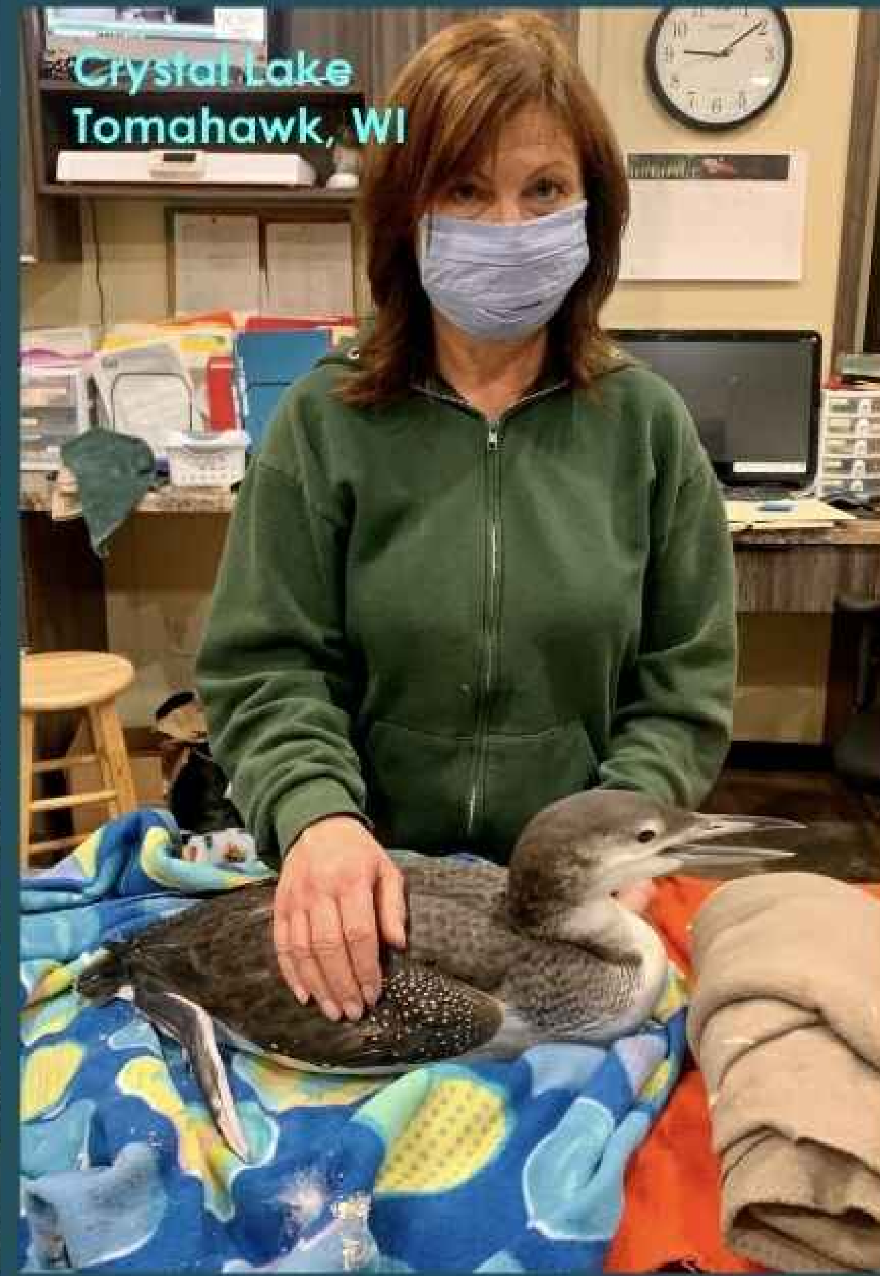
Crystal Lake Tomahawk, WI