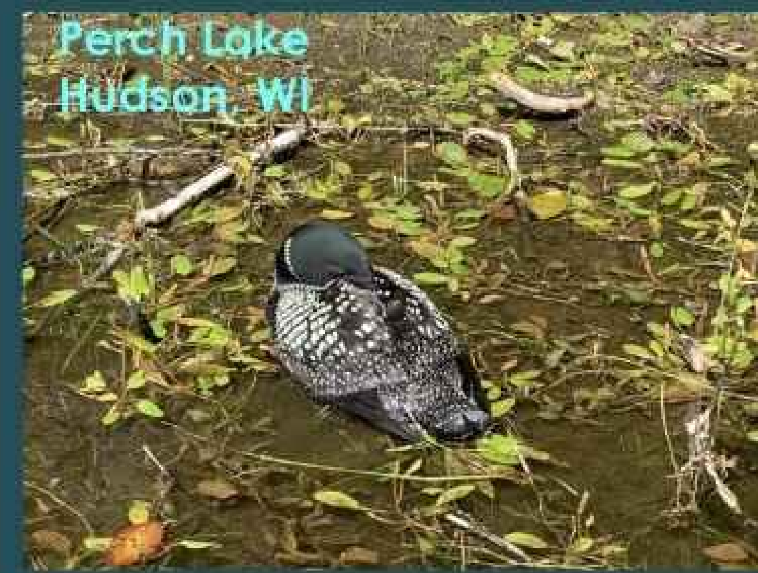
Perch Lake Hudson, WI