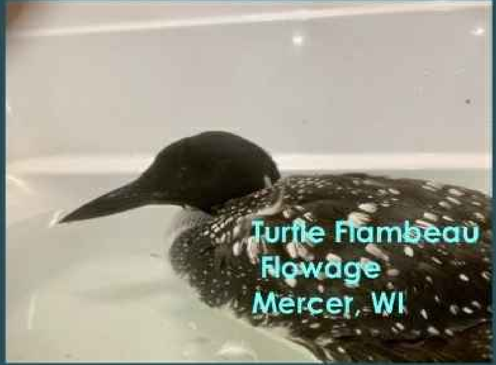
Turtle Flambeau Flowage Mercer, WI