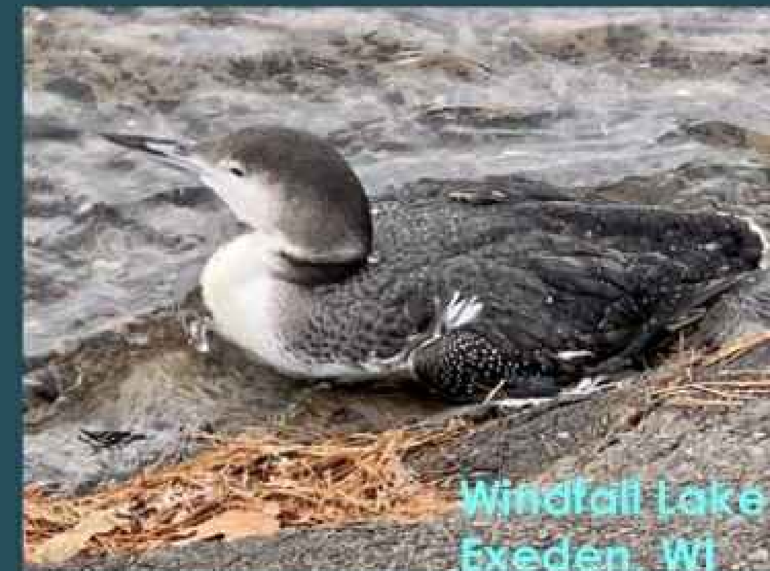
Windfall Lake Exeden, WI