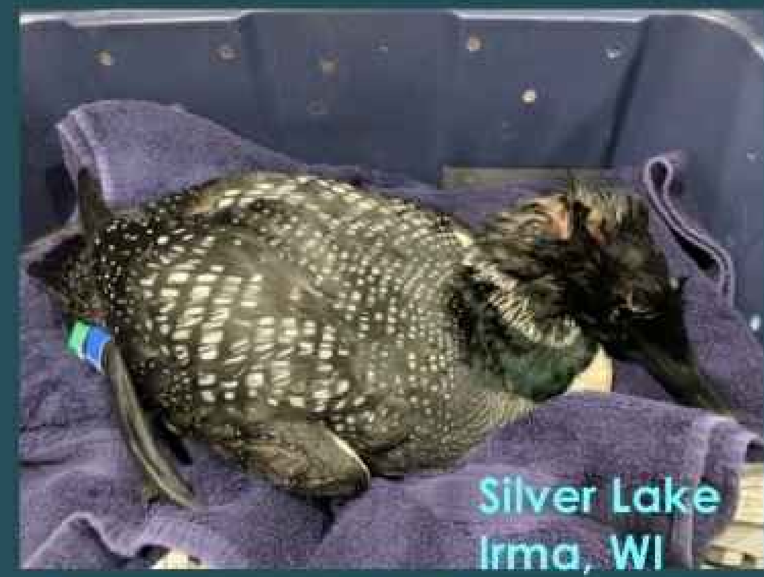
Silver Lake Irma, WI