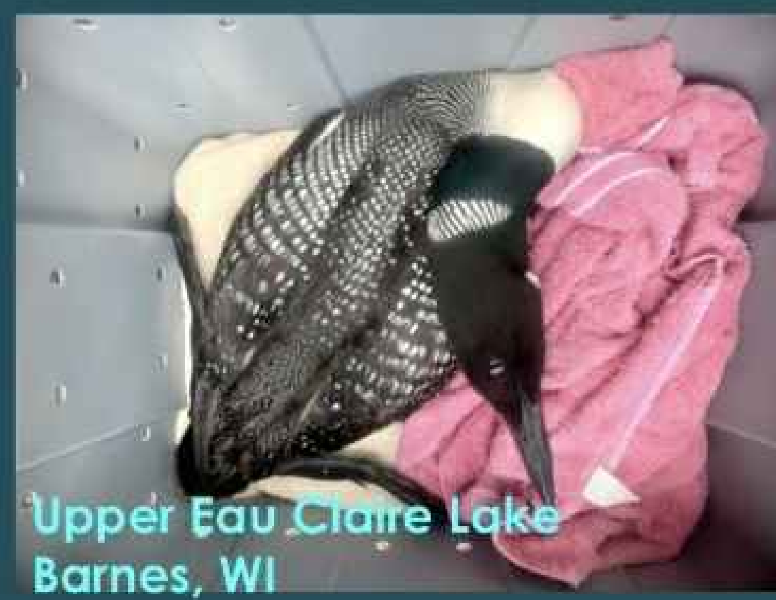
Upper Eau Claire Lake Barnes, WI