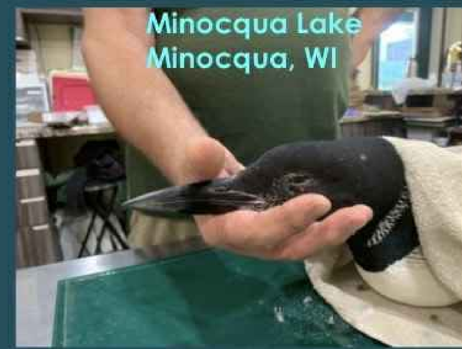
Minocqua Lake Minocqua, WI