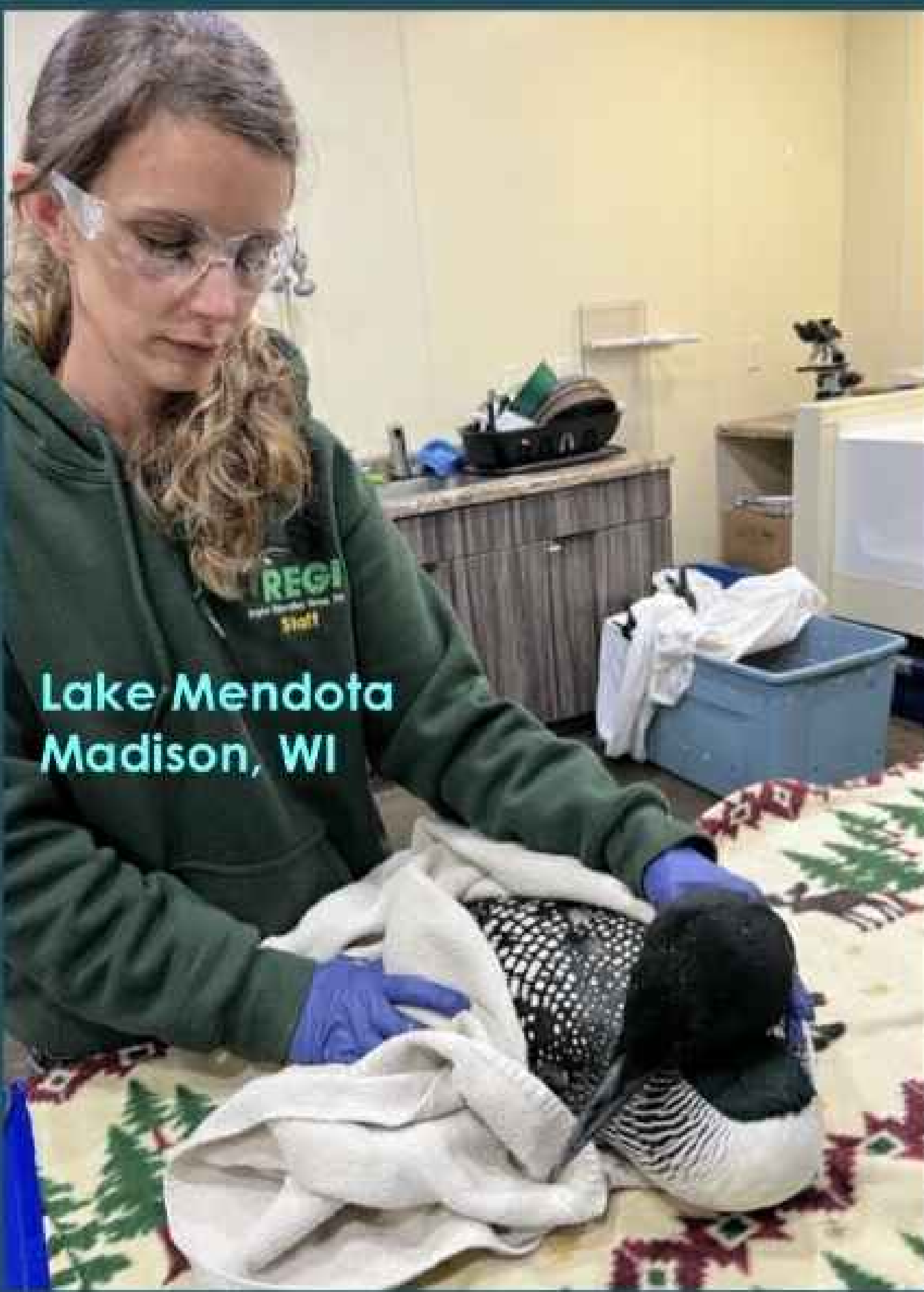
Lake Mendota Madison, WI