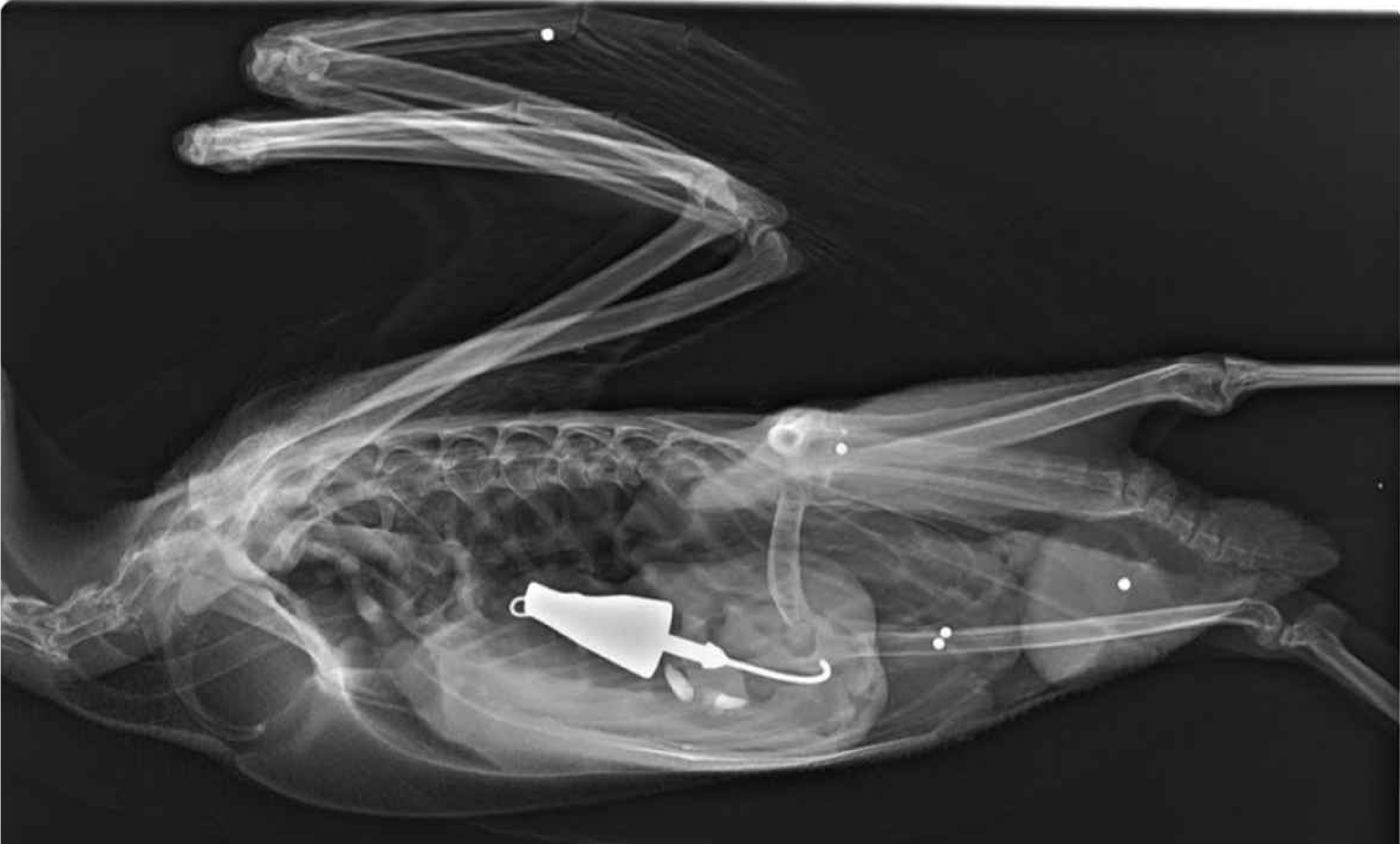
X-Ray of lead-poisoned loon - Cummings School of Veterinary Medicine at Tufts University