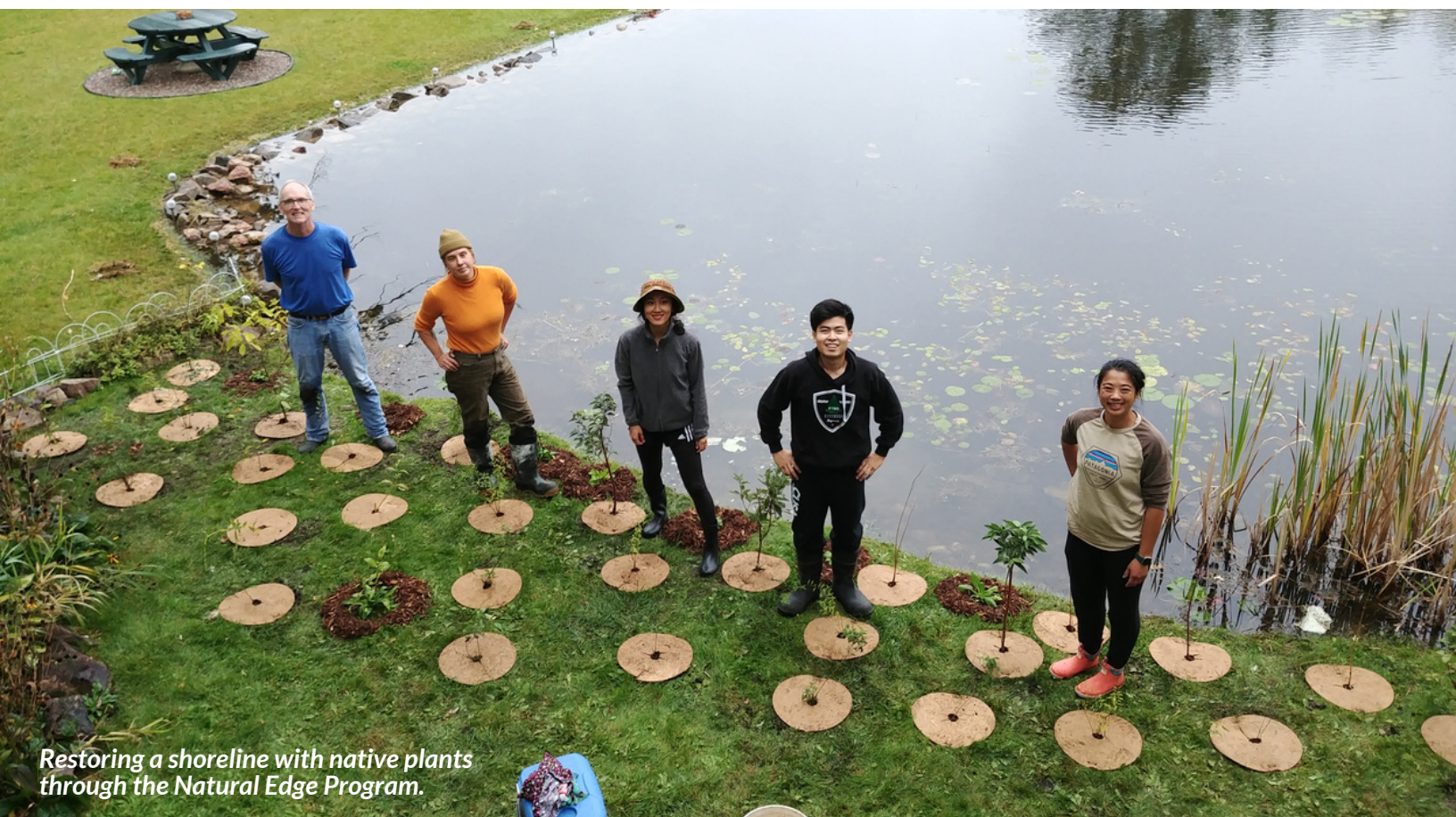
Restoring a shoreline with native plants through the Natural Edge Program.

We thank all applicants for their interest but only those selected will be contacted. To learn more about Watersheds Canada, visit watersheds.ca